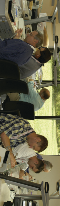
Implant Placement from a Prosthodontic Perspective